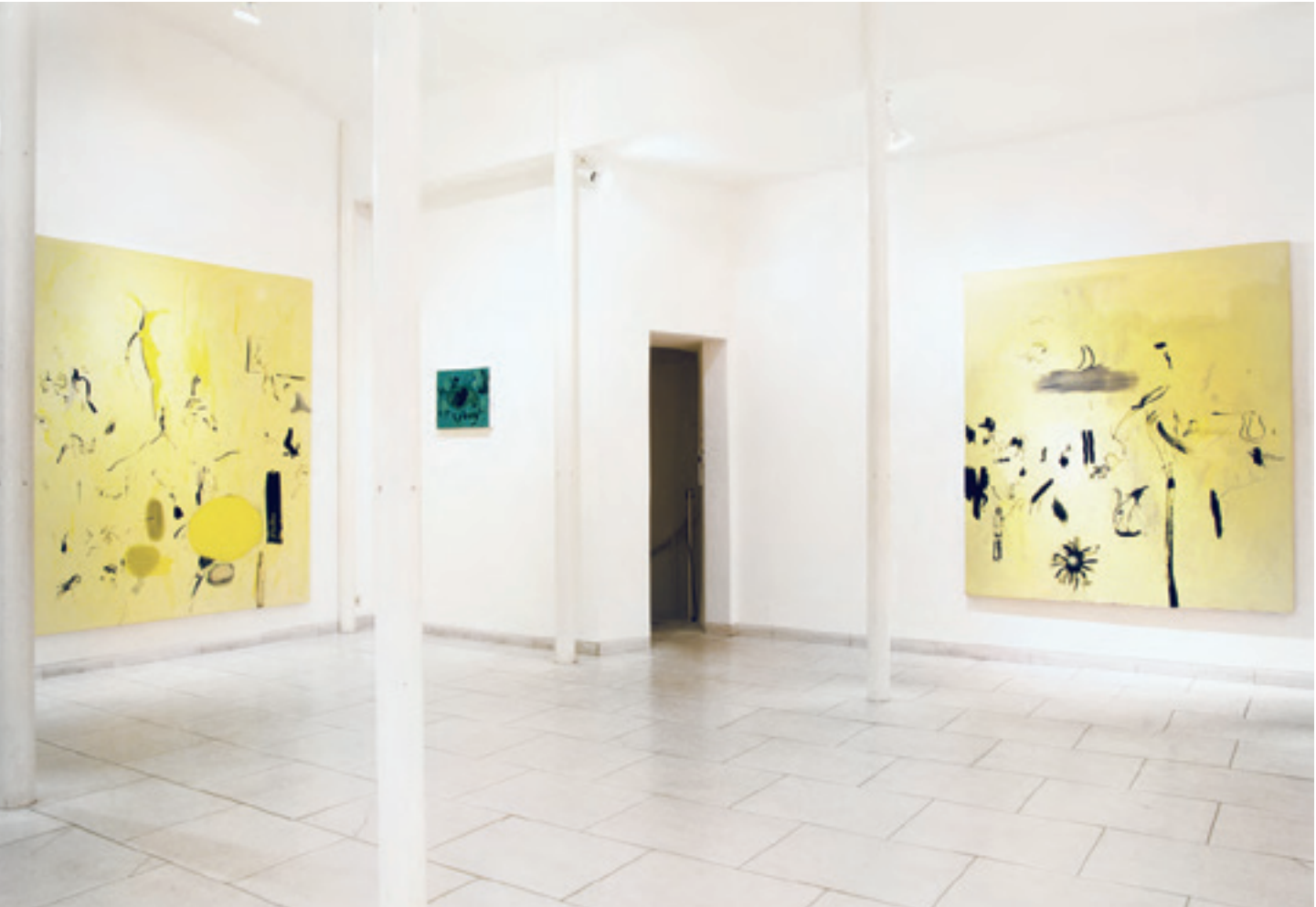
Left Exterior view Above right Nightlife, 1995, acrylic on canvas, 38×46 cm Below right Installation view, main space: Problem areas, 1995, acrylic on canvas, 212×182 cm; Nightlife, 1995, acrylic on canvas, 38×46 cm; President's Day, 1995, acrylic on canvas, 183×161 cm