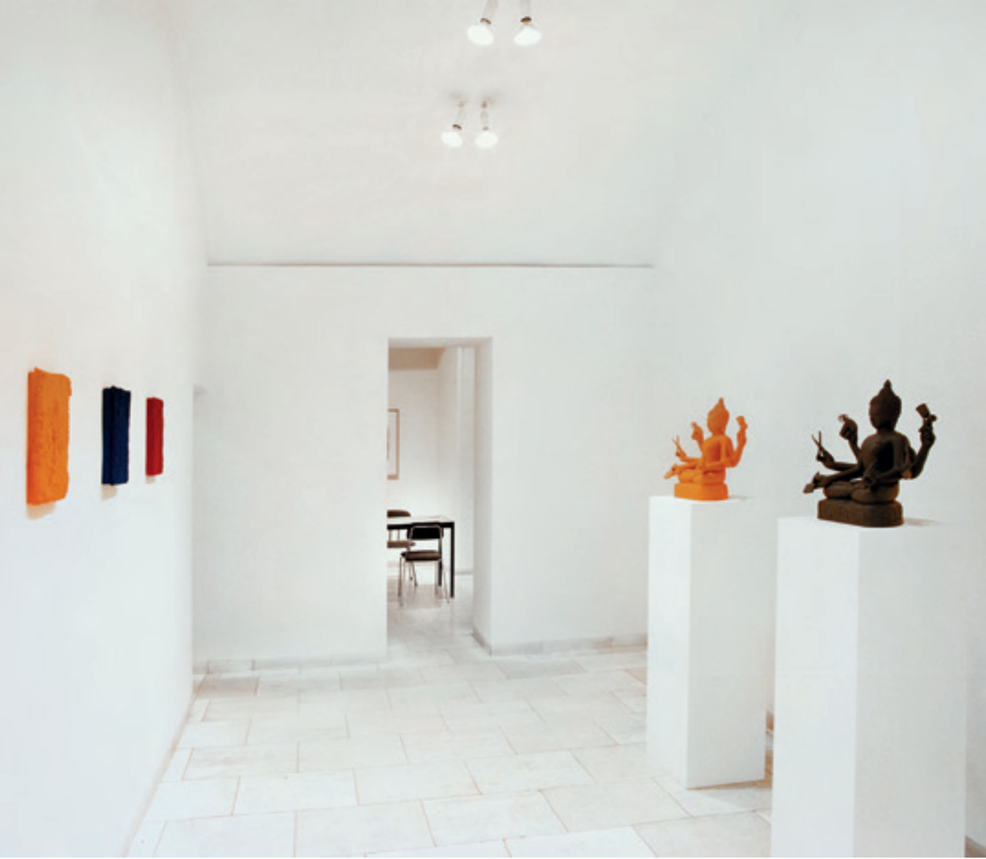
Left Untitled, 1994, urethane rubber cast, 47×51×22.9 cm Right Installation view, space two: Untitled, 1995, urethane rubber cast, 33×25.5×2.5 cm each; Untitled, 1994, urethane rubber cast, 47×51×22.9 cm each