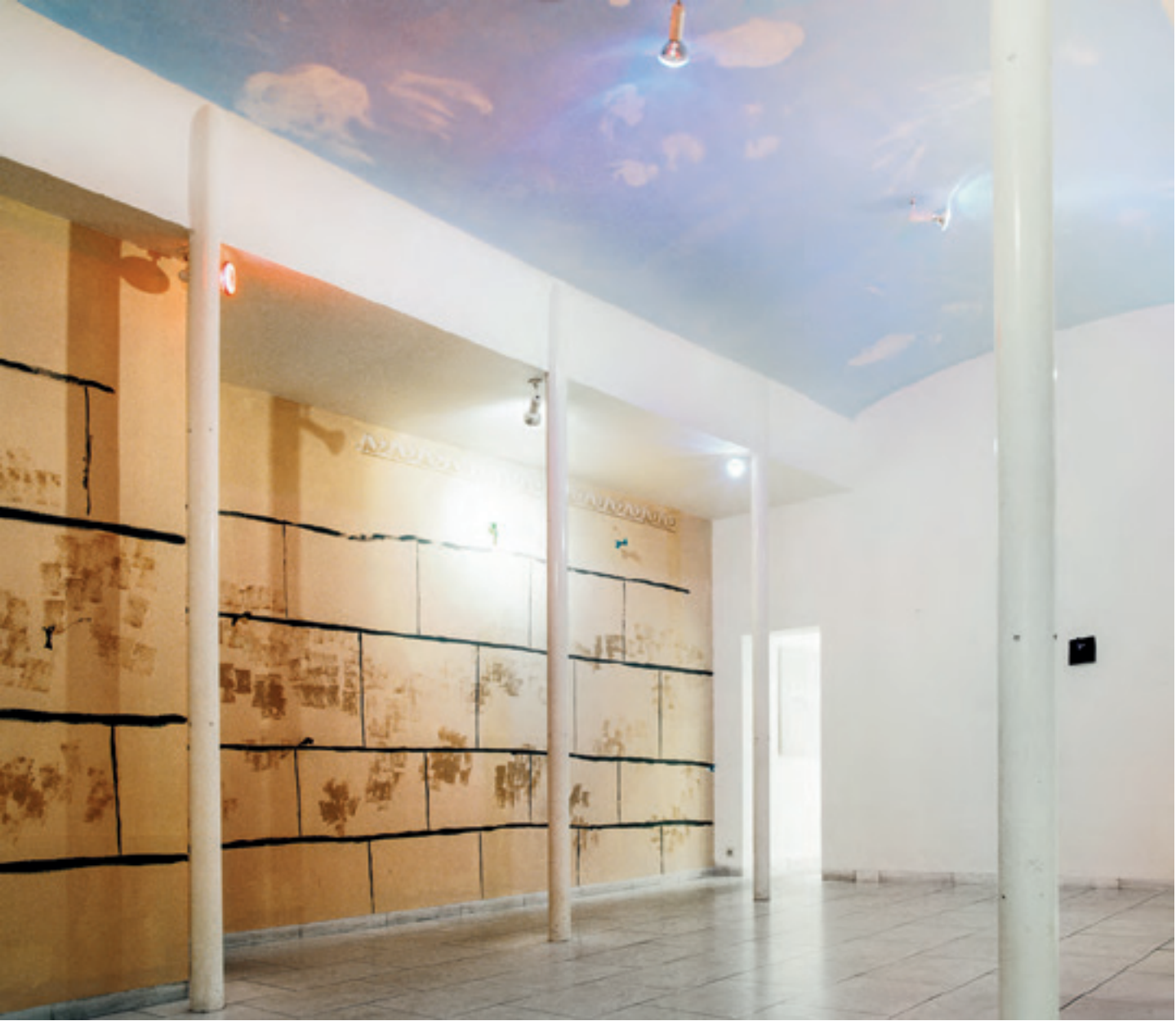
Right Installation view, main space: Wall Painting with Butterflies