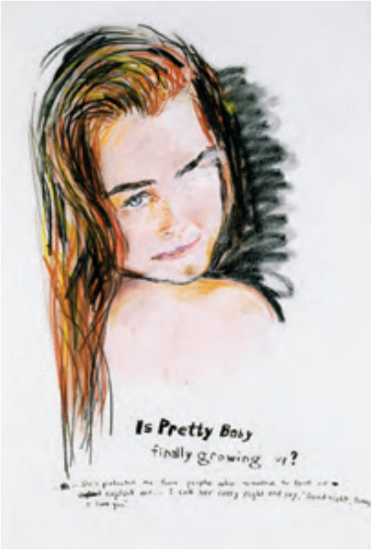
Above left Installation view, space two, clockwise: Untitled (fire), acrylic on canvas, 56×43cm; Untitled (building), acrylic on canvas, 45×57 cm Untitled (fire), acrylic on canvas, 45×56 cm; Below left Pretty Baby, 1990, chalk on paper